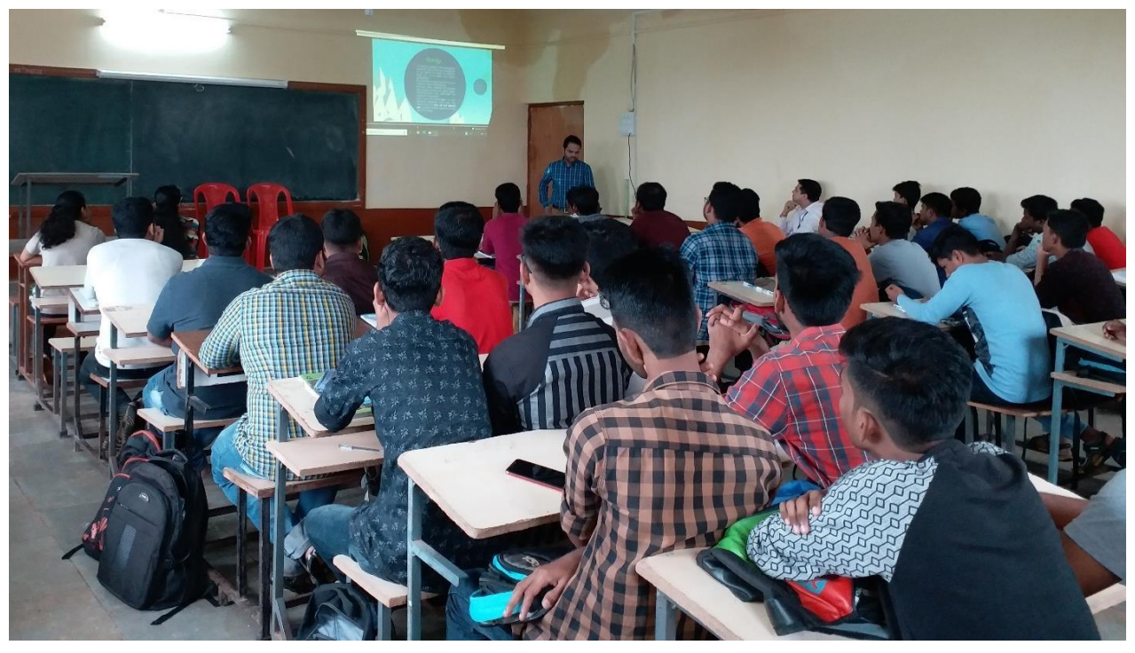
Third Year Student Attending Seminar on Renewable Energy in Marine Environment